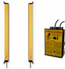
Three light curtain box

Controlled Motion Dynamics traveled to the customer's facility, inspecting and gathering information on each press. Controlled Motion Dynamics then created several options for the customer, who opted for safety light curtain systems.