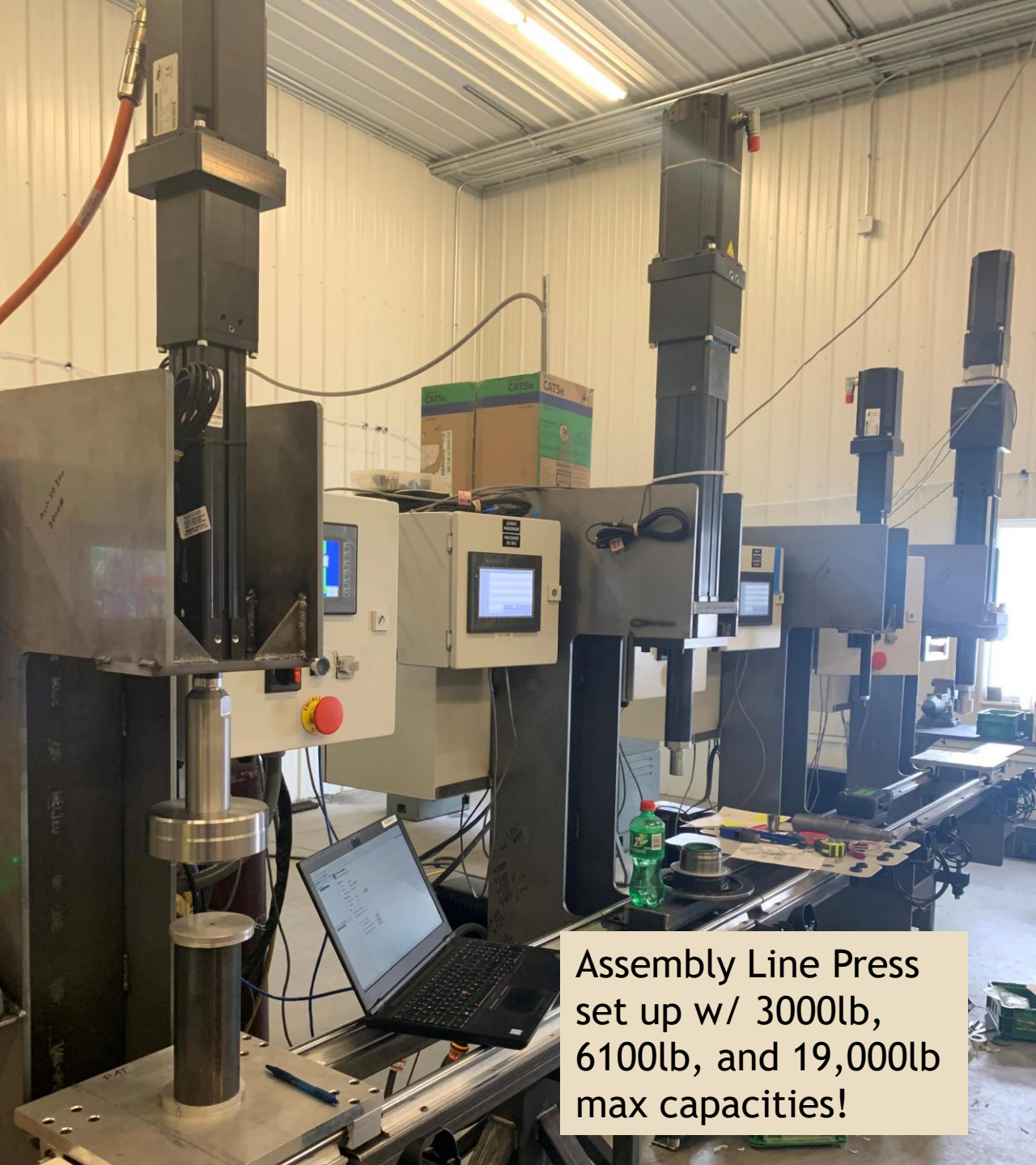
Assembly Line Press set up w/ 3000lb, 6100lb, and 19,000lb max capacities!