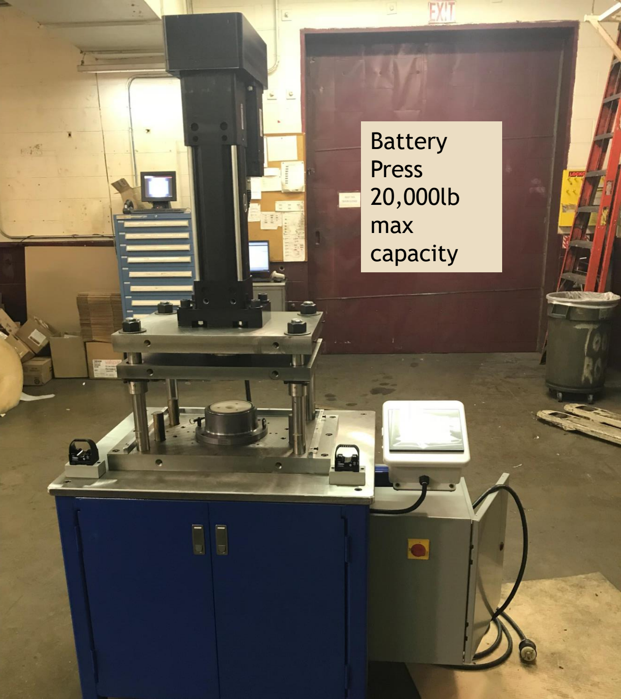
Battery Press 20,000lb max capacity