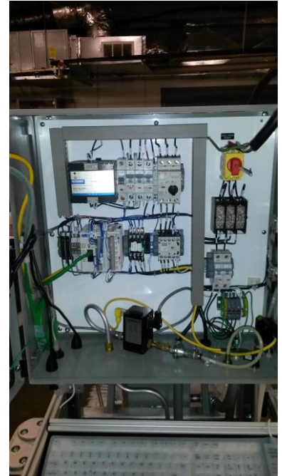
Control Panel internals